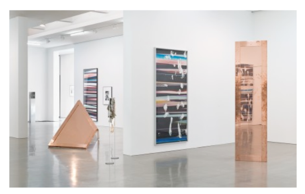
Walead Beshty, Selected Bodies of Work (Installation View)

Currently on view at Regen Projects in Los Angeles is an exhibition of new work by L.A.-based English photographer, writer and sculptor Walead Beshty, featuring photographs, sculptures, ceramics, and collages surrounding a theme of bodies and labor, specifically in relation to the physical process of art making.