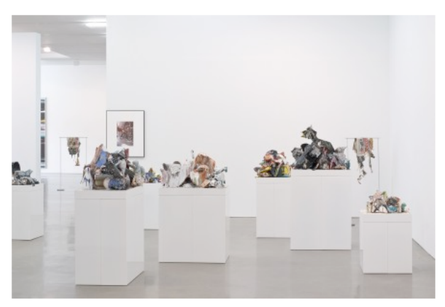
Walead Beshty, Selected Bodies of Work (Installation View)

Challenging modes of work and techniques of depiction in the modern landscape, Beshty's exhibition is on view at Regen Projects in Los Angeles through April 5, 2014.