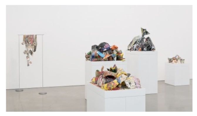
Walead Beshty, Selected Bodies of Work (Installation View)

For the current exhibition, Beshty has created a series of photograms entitled RA4 Contact Prints, produced on an ageing color processor, which, due to its deterioration, makes serrated color lines across the picture plane, making visible the processor's misaligned parts and frequent jamming. In a similar series, titled Cross-Contaminated RA4 Contact Prints, Beshty reveals handprints as they make contact with the surface of the photograph during exposure, highlighting the developing process and showing the labor involved in the analogue photographic process by injecting a physical imprint. Also on display are deconstructed computers, printers, projectors, and scanners on aluminum rods, visualizing the machines that experience this "mechanical breakdown."