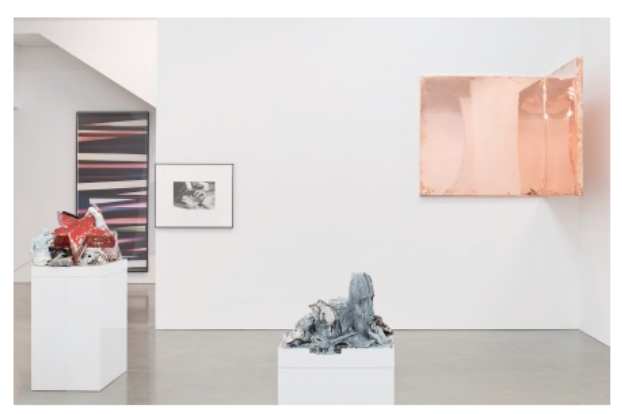
Walead Beshty, Selected Bodies of Work (Installation View)