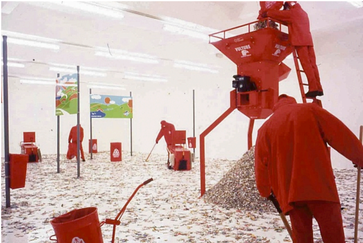
Michael Landy, Scrapheap Services, 1995: A fictitious cleaning company representing loss of human potential.