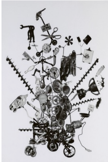
Michael Landy, Machine Created to Destroy Tinguely Museum, 2009, Michael Landy.