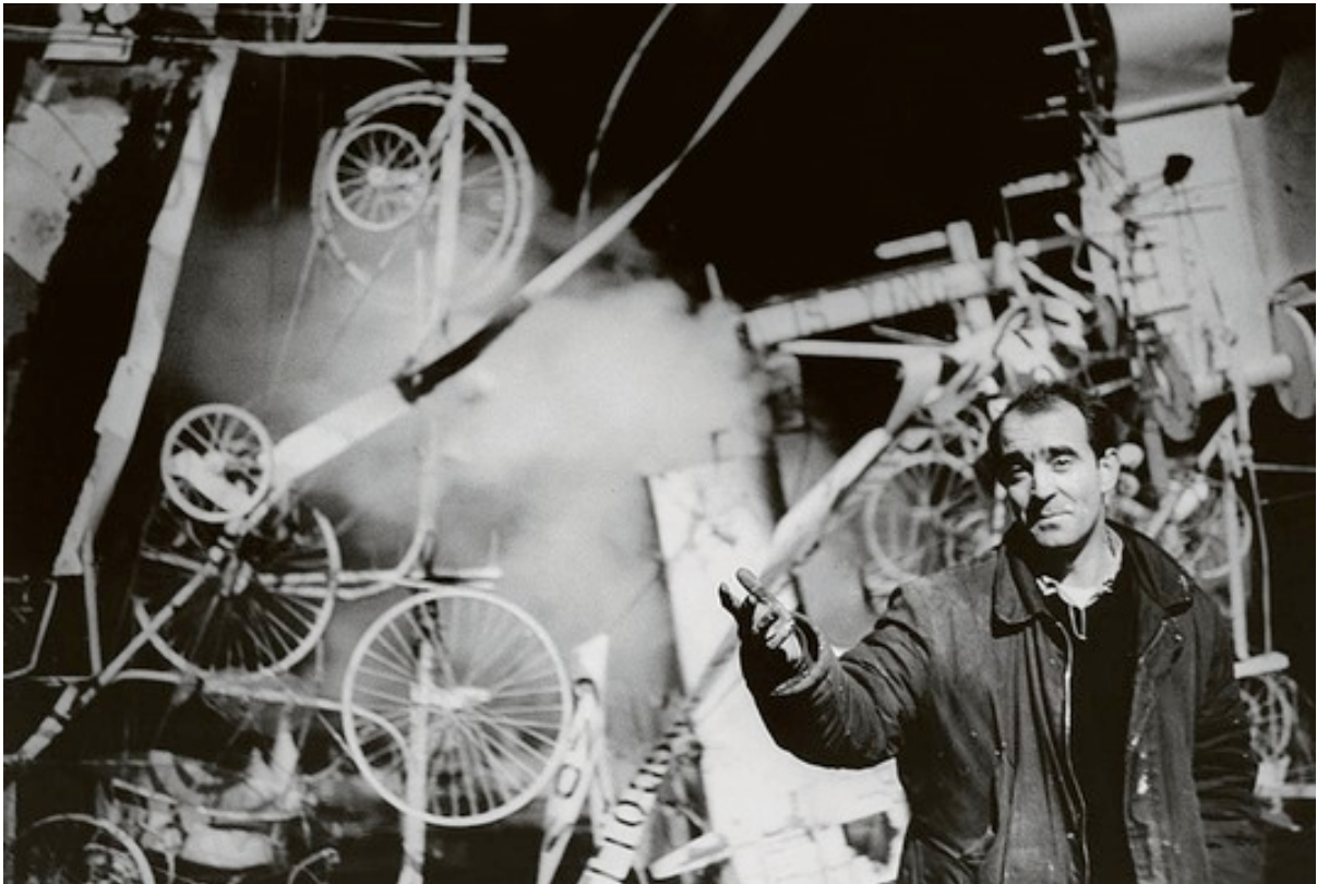
Jean Tinguely with his work Homage to New York in 1960.

Also running through Landy's work, whether explicitly or implicitly, has been an obsession with the kinetic sculptures of Jean Tinguely. Landy has made numerous drawings directly after the Swiss artist, and in 2010, he organised an exhibition of his and Tinguely's works at Tate Liverpool. He also made a documentary film based on his (unsuccessful) attempt to recreate Tinguely's self-destructive 1960 sculpture Homage to New York . We spoke to Landy, who is represented by Thomas Dane Gallery at the fair, as he prepared his first major survey show, Out of Order (until 25 September), which is now on view at the Tinguely Museum in Basel.