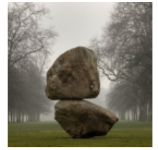
Rock on Top of Another Rock

Qui il contenuto per il footer di stampa