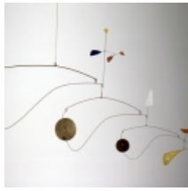
Calder After the War