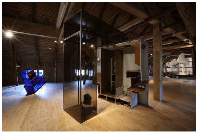
Zabludowicz Collection Announces 2014 Sarvisalo Finland Artist Residency Programme