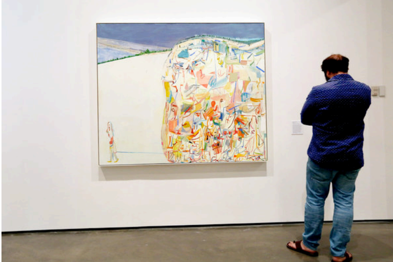
Amy Sillman's "Me & Ugly Mountain" (2003).

Later on, a group of black-and-white drawings of cuddling couples is revealed to be the unlikely source of a series of colorful, entirely geometric paintings. You can spend a lot of time in this room, figuring out how Ms. Sillman got from one body of work to the other. (It has to do with the negative space between the figures.)