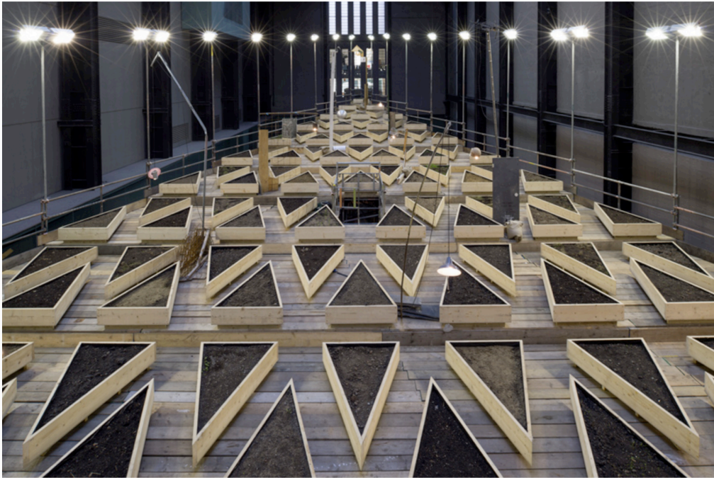
two stepped triangular platforms extend across the vast space

throughout the duration of the project, the soil is lit by lampposts constructed by the artist, made with materials found in building sites around museum. even though the artist has not intentionally planted anything within the planters, flowers, mushrooms, and other greenery may grow depending on what seeds have found their way into the soil. this uncertainty promotes the theme of hope and unpredictability, inviting visitors to see the sculpture change from one week to the next. within london's bustling urban fabric, cruzvillegas' 'empty lot' offers a refuge, where nothing is produced but where change might happen.