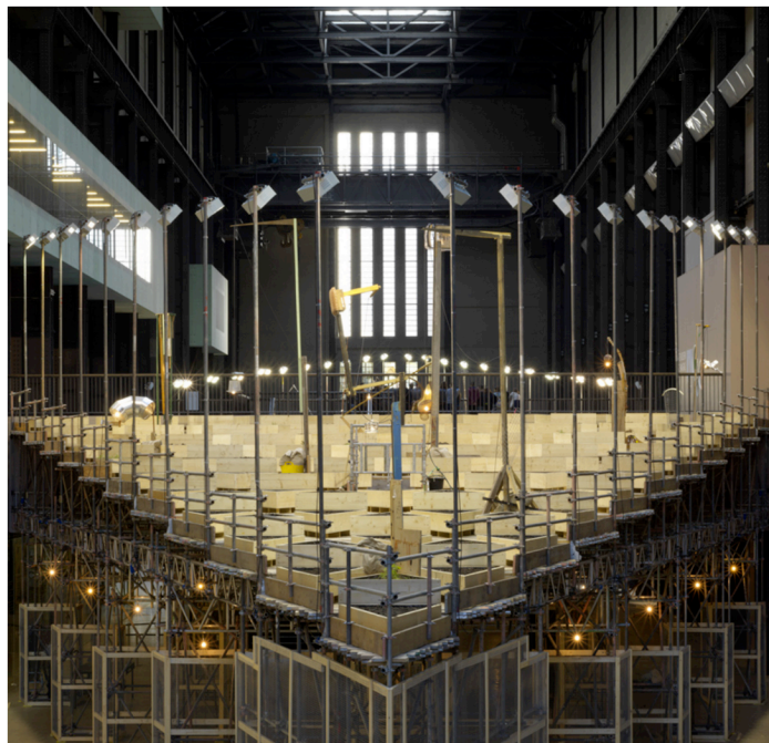
the soil is lit by lampposts constructed by the artist, made with materials found in building sites around museum

throughout the duration of the project, the soil is lit by lampposts constructed by the artist, made with materials found in building sites around museum. even though the artist has not intentionally planted anything within the planters, flowers, mushrooms, and other greenery may grow depending on what seeds have found their way into the soil. this uncertainty promotes the theme of hope and unpredictability, inviting visitors to see the sculpture change from one week to the next. within london's bustling urban fabric, cruzvillegas' 'empty lot' offers a refuge, where nothing is produced but where change might happen.