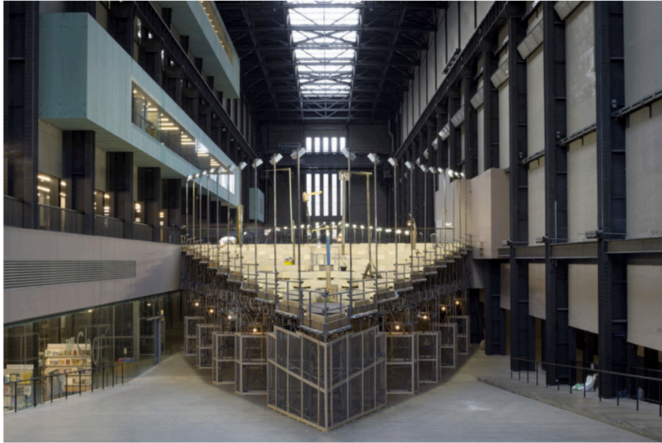
within london's bustling urban fabric, cruzvillegas' 'empty lot' offers a a natural refuge