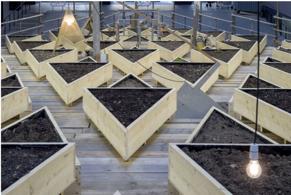
flowers, mushrooms, and other greenery may grow depending on what seeds have found their way into the soil

http://www.designboom.com/art/abraham-cruzvillegas-hyundai-commission-empty-lot-turbine-hall-tate-10-22-2015/