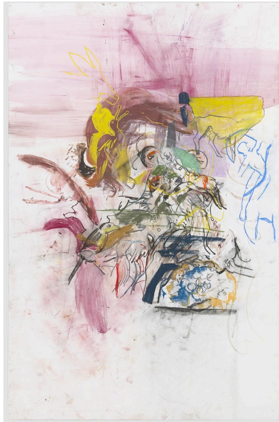
‘Untitled (After Bosch and Boldini)’ (2015). PHOTO: GENEVIEVE HANSON/CECILY BROWN

“It departs from accuracy derived from a source,” he said, “and becomes pure invention.”