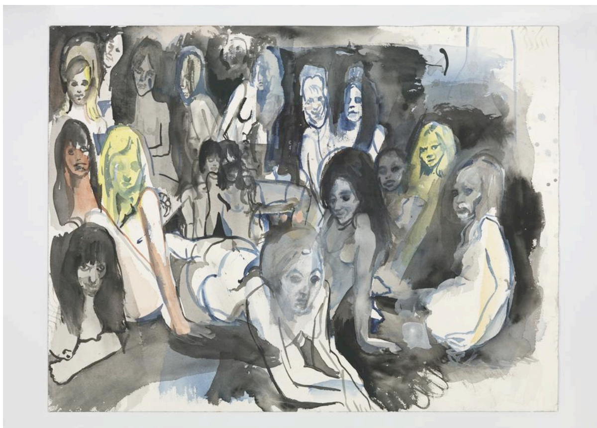
Cecily Brown's 'Untitled (Ladyland)' (2012) is part of 'Rehearsal,' an exhibition opening Friday at the Drawing Center in SoHo.

'Rehearsal' highlights the sketches that helped painter Cecily Brown hone her craft