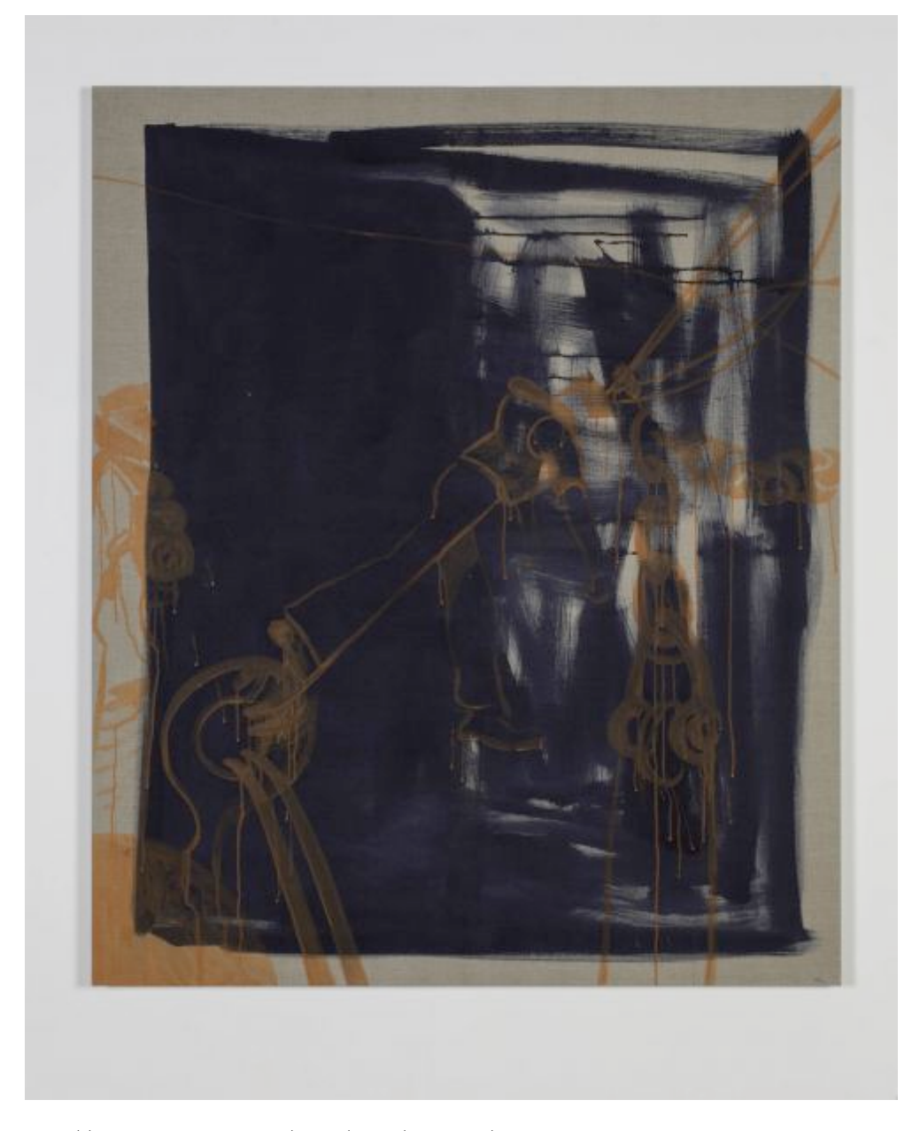
http://uk.blouin artin fo.com/news/story/1720803/caragh-thuring-reinvents-her-own-work-at-thomas-dane-gallery