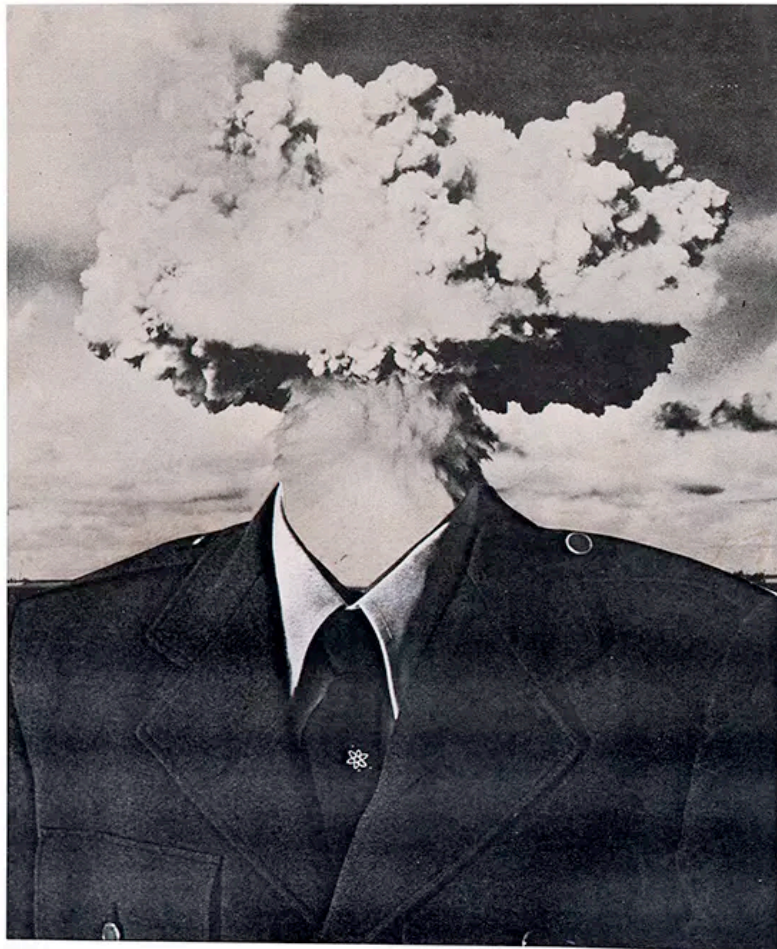
Bruce Conner's 'Bombhead' (1989)

11 DUKE STREET, ST JAMES'S, LONDON SW1Y 6BN