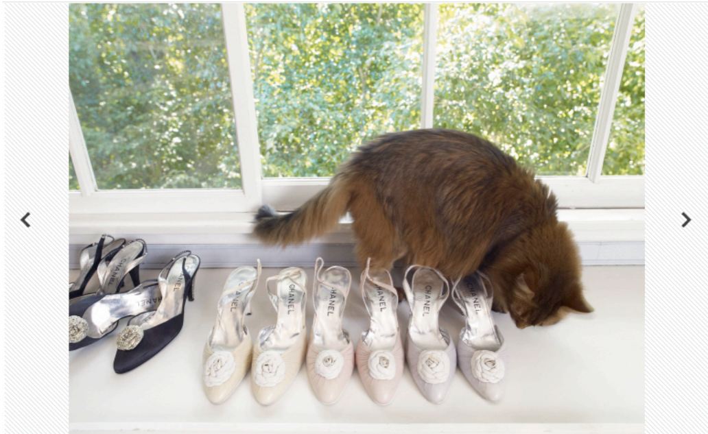
The Lower East Side show, 700 Nimes Road , focuses on the objects and interiors owned and created by actress Elizabeth Taylor, as seen through Opie's lens. Pictured: Fang and Chanel , 2010-11