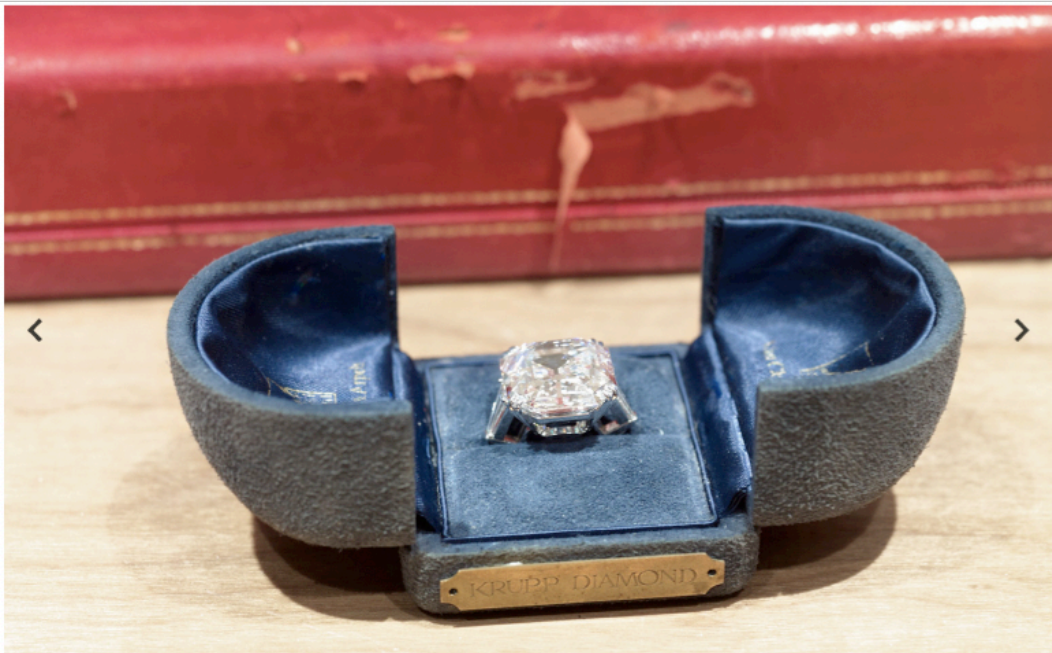
This intimate collection of images was captured in 2010, prior to the Hollywood icon's death in March the following year. Pictured: Krupp Diamond , 2010-11