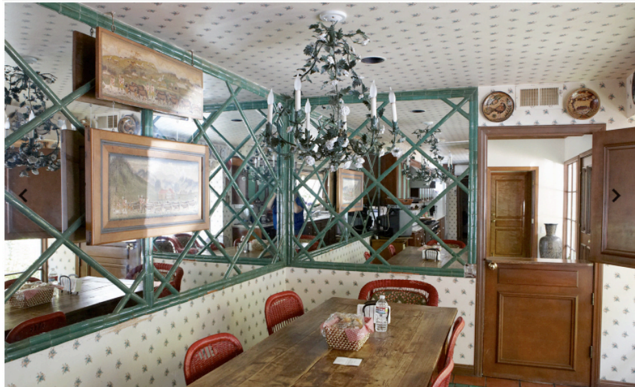
As well as this epicentre of activity in New York, select pieces from the '700 Nimes Road' collection are also being displayed in LA at LACMA's Pacific Design Center in West Hollywood; while an entirely distinct portrait exhibition opens at LA's Hammer Museum on 30 January this year. Pictured: Kitchen Table, 2010-11