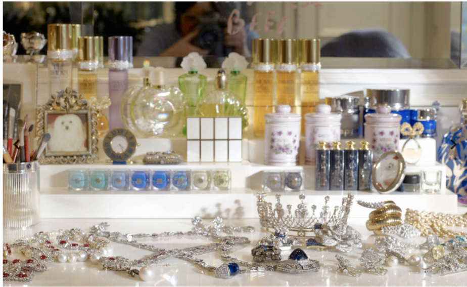
The Quest for Japanese Beef, 2010-11