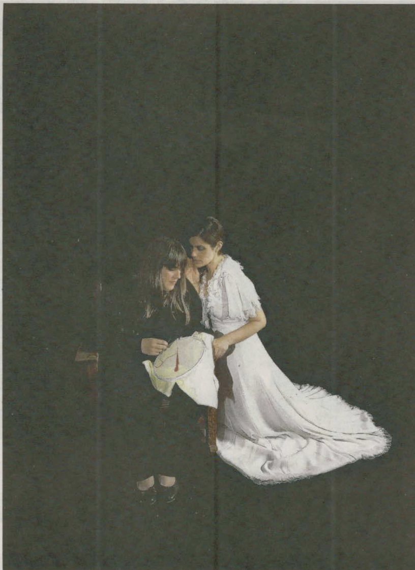
"KATE & LAURA" Mulleavy, the sister fashion designers, in a portrait by Catherine Opie at the exhibition "Hammer Projects: Catherine Opie: Portraits" at the Hammer Museum.

The MOCA show includes large-format images from the resulting "Closets and Jewels" series as well as work from a 50-image portfolio that Opie created as a limited edition, cloth-bound artisan box with embossed text.