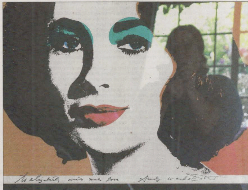
"ANDY WARHOL to Elizabeth" includes a reflection of Opie in the photograph.

When Opie was 8, she saw a Lewis Hine photograph in a school book. She came home and declared to her parents that she was going to be a social documentarian photographer. For her birthday that year, her parents gave her a Kodak Retina camera.