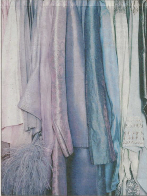
"UNTITLED #5" of Elizabeth Taylor's closet in the MOCA exhibit "700 Nimes Road," the address of late actress' home.

As different as the exhibitions are, there's a definite synergy between them. Opie is nothing if not culturally contextual. A voracious reader, TV watcher and museum-goer — currently on the board of MOCA and formerly on the board