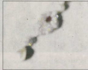
"LE PEREGRINA (Elizabeth Taylor)," a bit of jewelry.